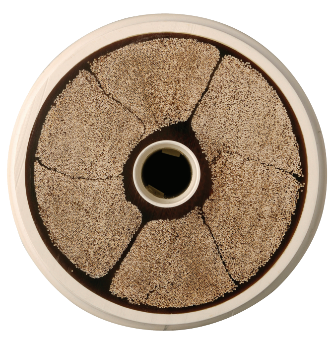
HOLLOW FIBRE MEMBRANE ELEMENT

With water injection systems installed across the globe, Eta has extensive reference lists available upon request.