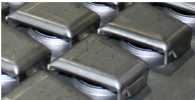
The new FLEXIPRO® valve.

The FLEXIPRO® valve features a specially shaped deck orifice to reduce pressure drop and delay weeping. The redesigned valve cover is also larger than the deck orifice, which leads to reduced entrainment and enhanced sweeping of the deck for superior fouling resistance.